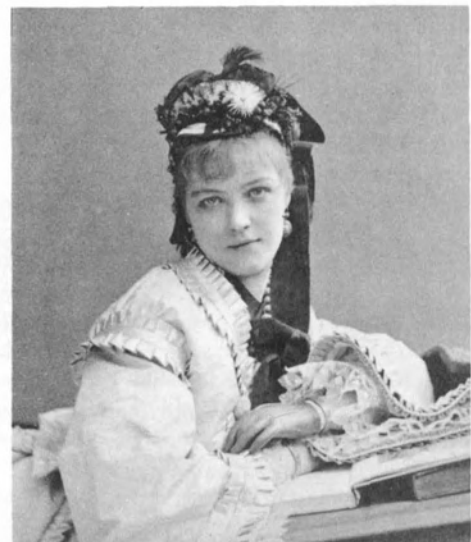
COVER: From the Society Notebook Column in This Issue.

Material in this publication may not be reproduced without written permission of the NSA, Inc.